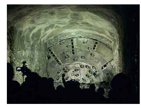
The breakthrough after almost five years: "Big Becky" finally sees light at the end of the tunnel

The project carried out by Ontario Power Generation and the Austrian construction company Strabag is designed to raise the capacity of the Sir Adam Beck Generating Station. It diverts the water of the Niagara Falls