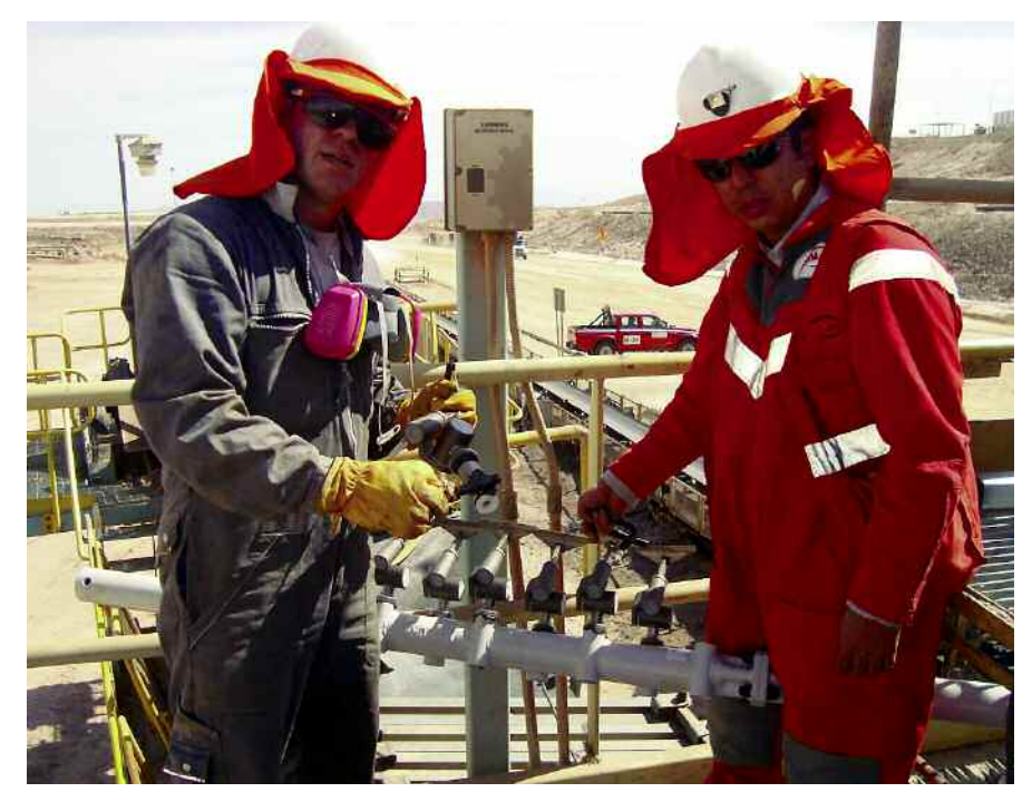
Heat and high altitude: the grueling conditions during the installation work in Chile ...

Since the beginning of 2011 TTM Chile is the official HOSCH distributor in Latin America