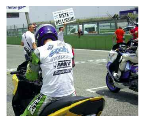
The scooter pilots speed over the Italian racing track in their HOSCH tricots