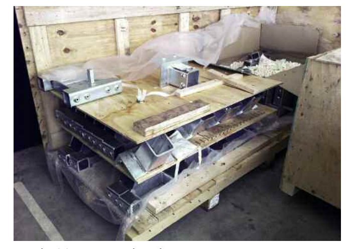
Even the tiniest parts get a barcode

After this, the customer decides whether it wants to entrust Kuhlmann with the packing or do the job itself. In the latter case it requires only packing material from Kuhlmann. Heidhues comments: "What is important for us is that Kuhlmann always reacts very flexibly. At its site in Marl, it has 2,000 square meters available for intermediate storage, orderpicking and packing; this area can be expanded flexibly to meet increasing requirements."