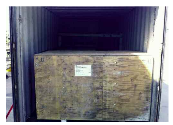
Seaworthy packing: the HOSCH crates are shipped overseas in a container