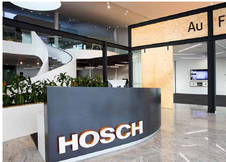
The design of the reception area is a real eye-catcher in the new HOSCH building.

The “Grand Opening” was the first time the new building was shown to the