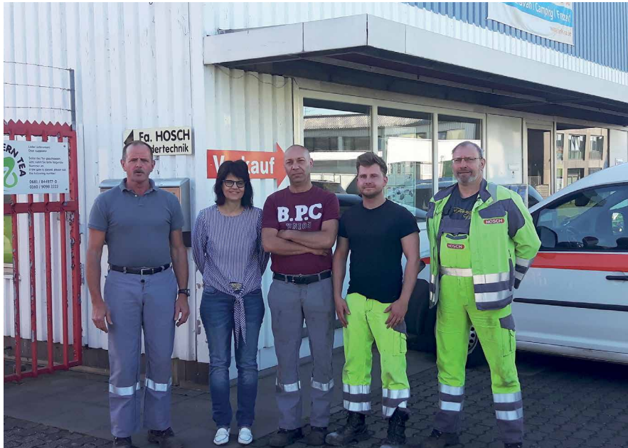
The team at HOSCH's Süd-West branch office in front of their offices and warehouse in Saarlouis.

HOSCH's seven branch offices in Germany can act and react quickly