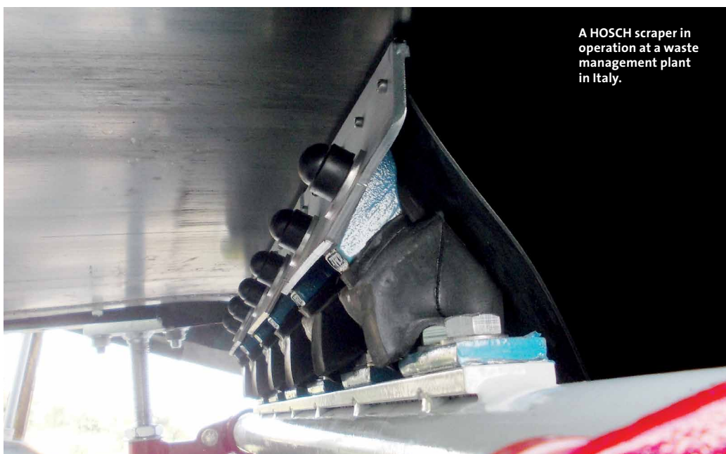
A HOSCH scraper in operation at a waste management plant in Italy.