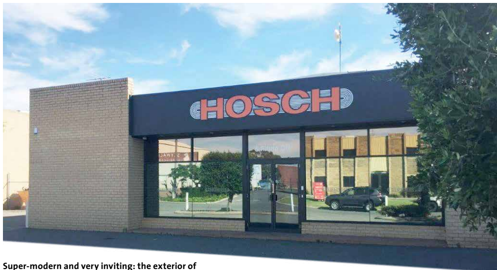
Super-modern and very inviting: the exterior of the new office of HOSCH International in Perth, Australia.