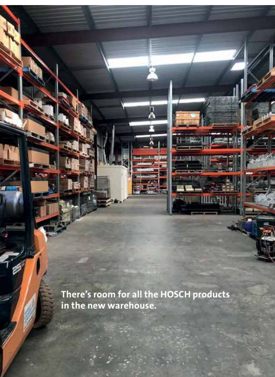
There's room for all the HOSCH products in the new warehouse.

During the following two weeks the offices were emptied and the complete