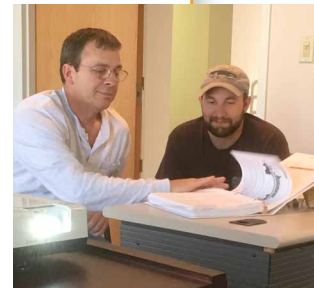
The HOSCH Company employees had a chance to update their theoretical know-how.