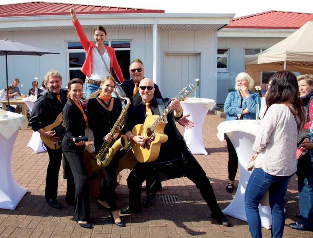
There was “music in the air” at HOSCH’s summer party – and a lot of finger-snapping rhythms!

“Getting to know you!” – A successful first at HOSCH Headquarters in Recklinghausen