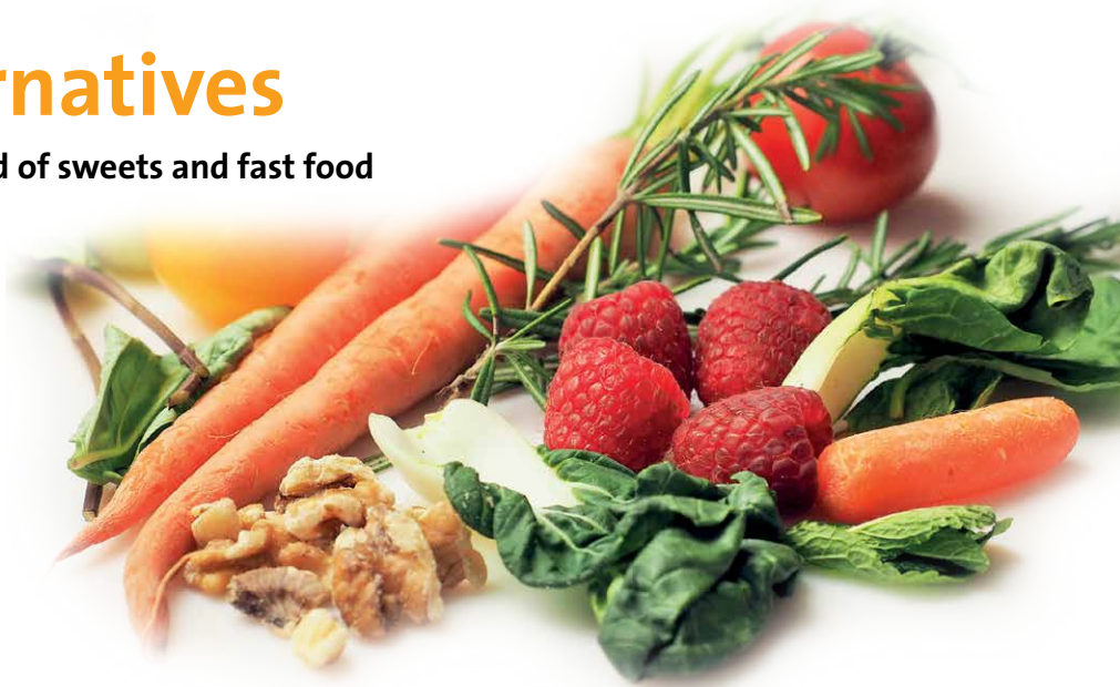
Not just healthy but tasty as well: fruit and vegetables from the region.

The response to the test phase was so enthusiastic that this measure, taken to foster a health-promoting work environment at