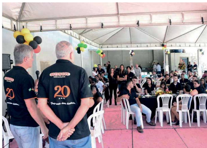
Scene at the big party thrown to celebrate the 20th anniversary of HOSCH do Brasil Ltda.